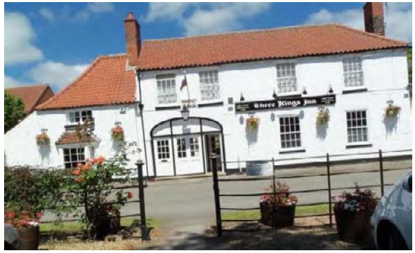
The Three Kings Inn, Threekingham

this scale never recovered. From its population of over 1,000 before the plague Threekingham's population dropped to a few hundred and never recovered.