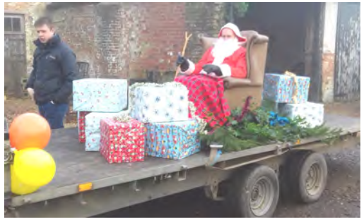
Santa and his elf

An adult asked "Who is Santa?" well of course, it was the real one, helped along by a well known farmer and his rather "younger" elves. The decorated trailer and tractor went throughout the village of Wigtoft with Santa waving to all. People and children came out to greet him and to share in the fun.