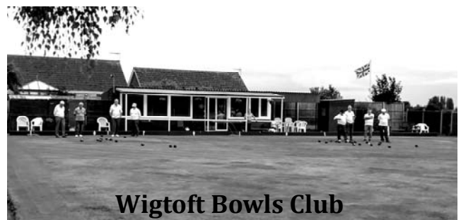
Wigtoft Bowls Club