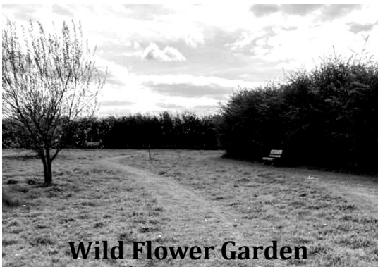
Wild Flower Garden