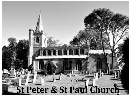
St Peter & St Paul Church