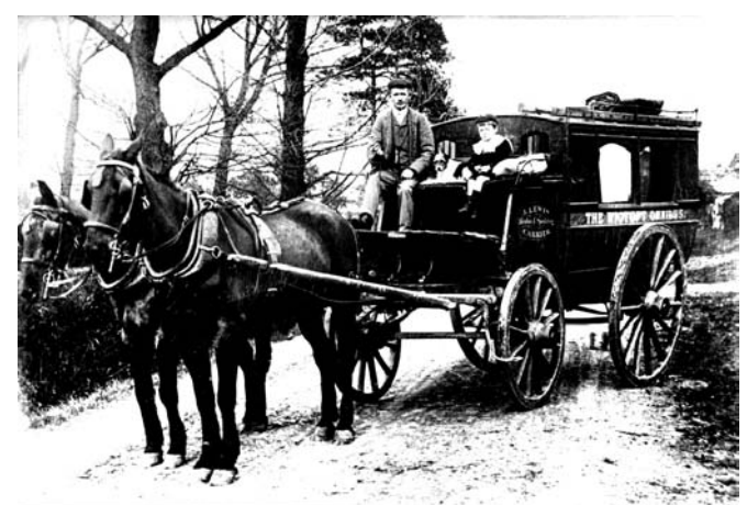
This was possibly the last bus before this year to come through Wigtoft , on the side it says The Wigtoft Omnibus

The bus number is B3 and you will find a copy of the bus timetable in the newsletter on page 11