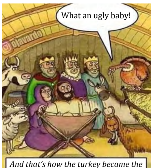
And that's how the turkey became the traditional Christmas dinner

The Wigtoft Village Newsletter and editorial team have taken all reasonable care in producing and publishing information contained in this publication, for which we assume no responsibility. The Wigtoft Village Newsletter does not warrant or make any representations regarding the use, validity, accuracy, completeness or reliability of any claims, statements or information. Under no circumstances, including, but not limited to, negligence, shall The Wigtoft Village Newsletter be liable for any direct, indirect, special, incidental, consequential or other damages, including but not limited to loss of profits. Furthermore, you may not modify or reproduce in any form, electronic or otherwise any information contained in this publication except for personal use unless you have obtained our express permission.